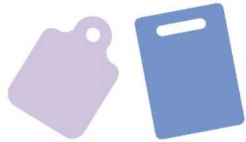
FOOD PREPARATION SURFACES