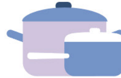
EATING UTENSILS & DISHES